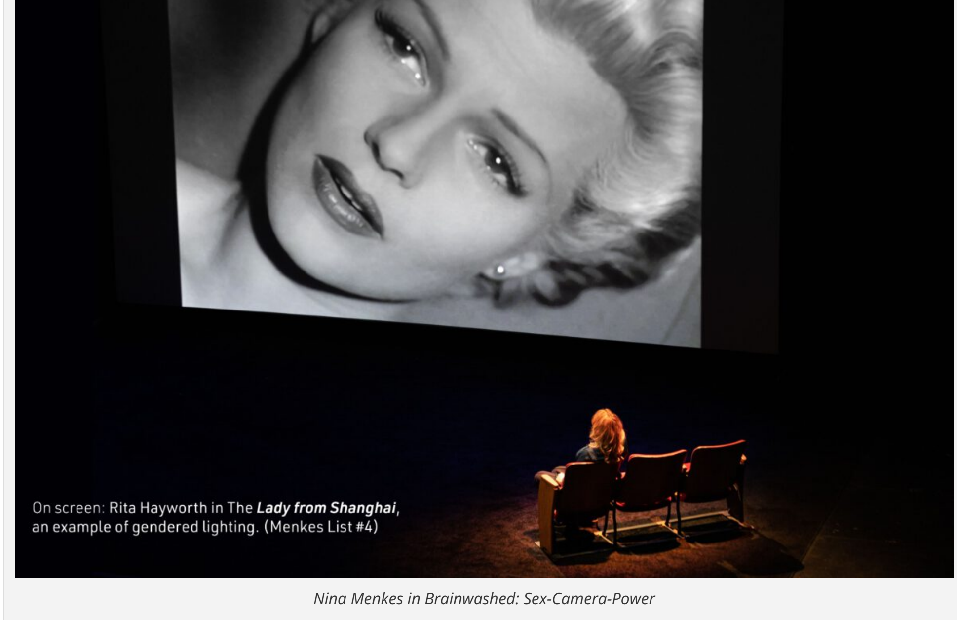
On screen: Rita Hayworth in The Lady from Shanghai , an example of gendered lighting. (Menkes List #4)

Using numerous examples from movies that span the entire history of Hollywood – everything from Metropolis (1927) to Vertigo (1958), to Raging Bull (1980), to Blade Runner 2049 (2017), Menkes expertly breaks down individual scenes to show that the way women are clothed (or not, in many cases), framed and even lit more often than not turns them into objects. Objects who exist only to service the men whose leering gaze they find themselves under.