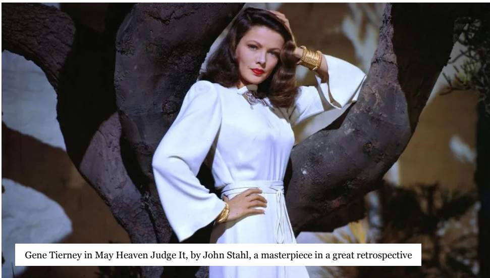
Gene Tierney in May Heaven Judge It, by John Stahl, a masterpiece in a great retrospective

One of the great advantages of a film festival is the possibility of discovering the invisible. It seems paradoxical but it is not: if it weren't for the samples, most of the films that are made or made in this world would be in a limbo where few people would know about their existence. It is also clear that this has worsened in recent years, when the international distribution and exhibition system has experienced an unprecedented concentration that has ultimately caused the dissolution of