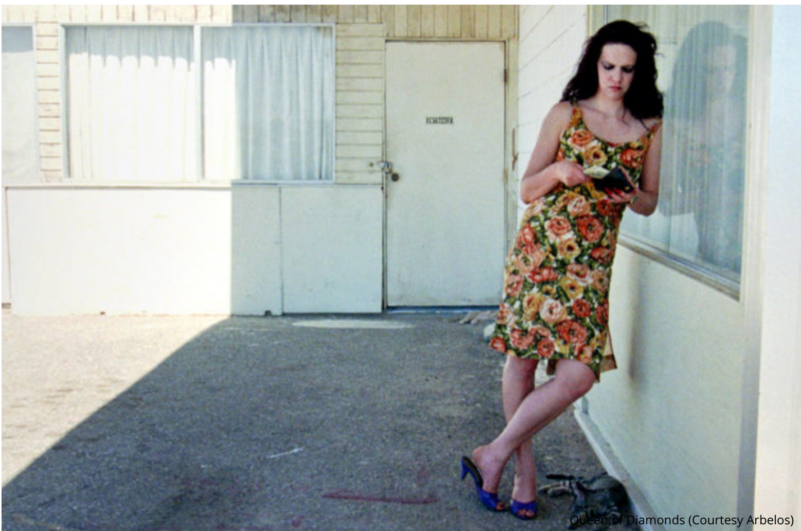
Queen of Diamonds