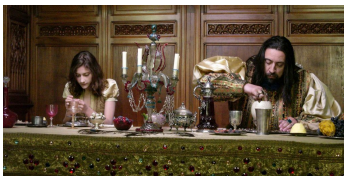
Bluebeard at the Movies