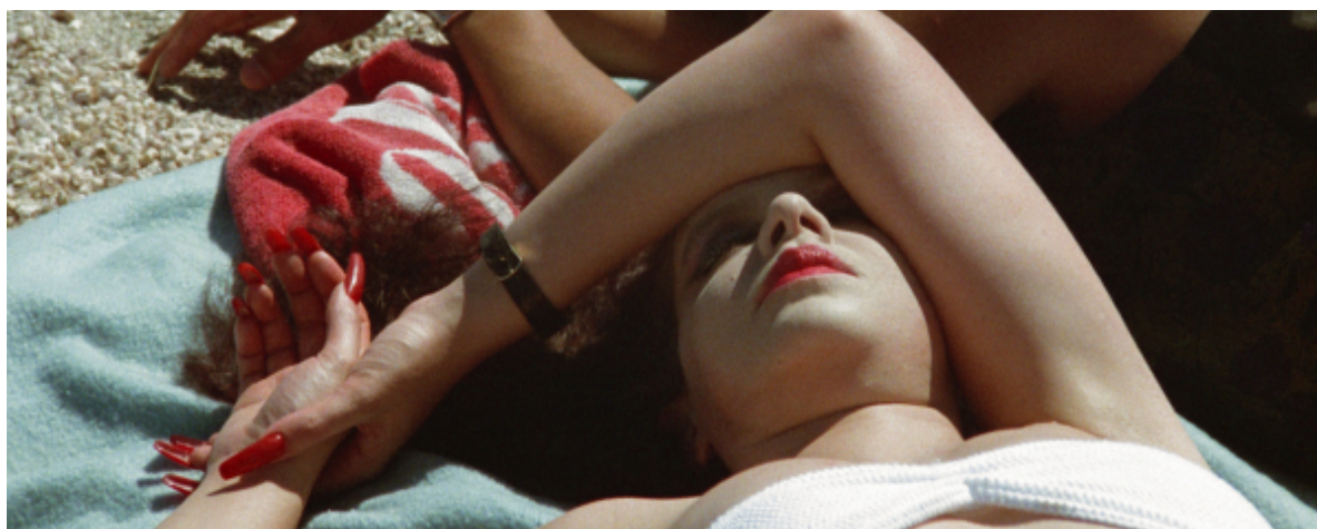
Queen of Diamonds

Biller: That's exactly the question for me: "Visual pleasure for whom?" I think we need a much more sophisticated discussion around movies, where we talk about which movies perform violence against women and which ones don't or are more nuanced. And I think we need to talk about the shift in movies from before and after the sexual revolution, because there was a radical shift in the way women in movies were viewed.