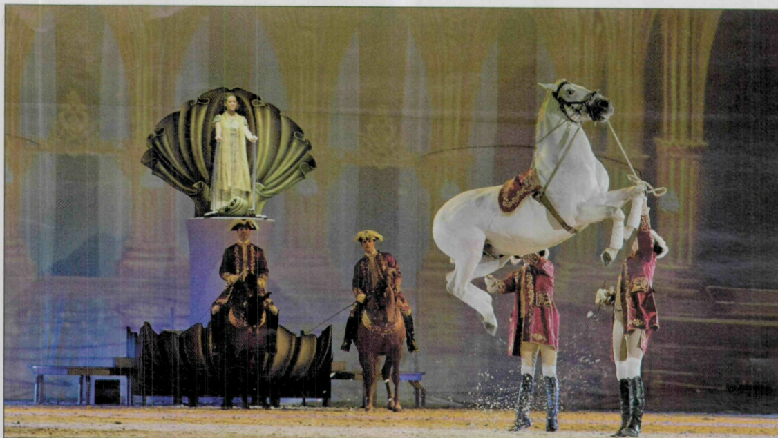
Some 40 horses will be showcased alongside their human castmates in the Stateside tour of "Apassionata."